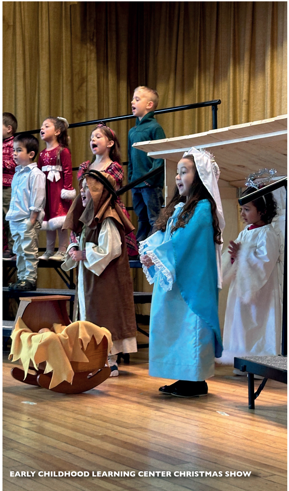
EARLY CHILDHOOD LEARNING CENTER CHRISTMAS SHOW