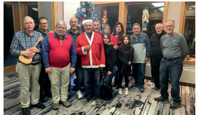
St. Lawrence O'Toole Knights of Columbus and parishioners spread some Christmas cheer caroling to the residents at Putnam Ridge on Dec. 14.